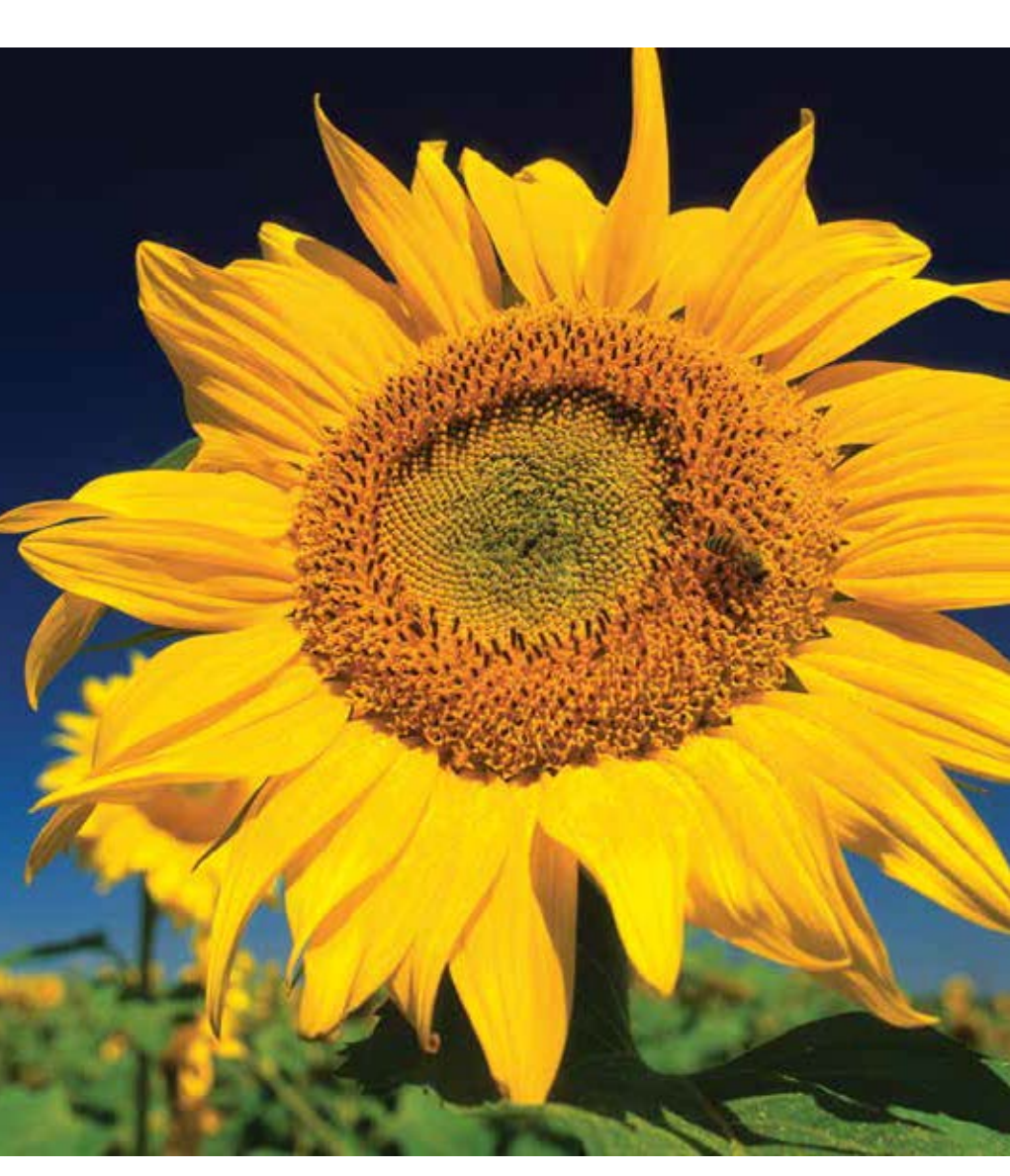
"Africa's Trade Credit & Political Risk Insurer"